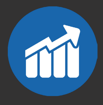
Improvement of business processes and procedures