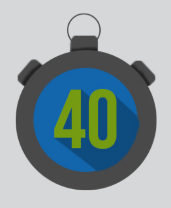
Every 40 seconds, a company is attacked by ransomware

Ransomware is a malicious software created by cyber attackers which blocks a users access to their data until a ransom is paid. Initially aimed at individuals, cyber attackers are now targeting businesses, with more and more being attacked each day.